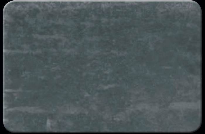
EuraZinc Pro Weathered