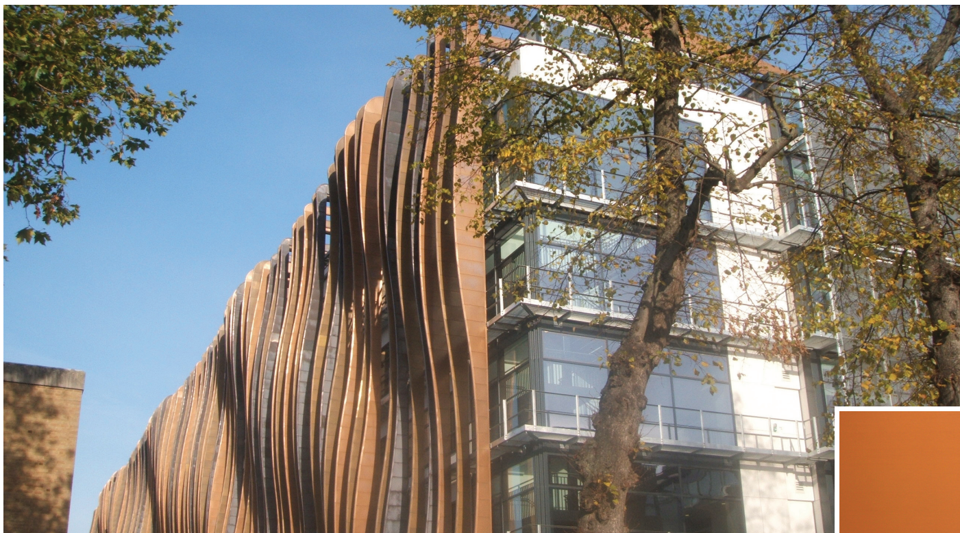
Vertical solar shading fins, each clad in either Nordic Bronze, Nordic Brass or Nordic Brown™. Holland Park School, London; Architects: Aedas.